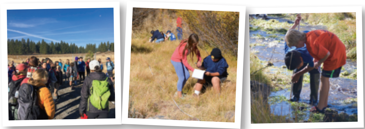
Headwaters Science Institute is the latest grant recipient of the Tahoe Donner Giving Fund.