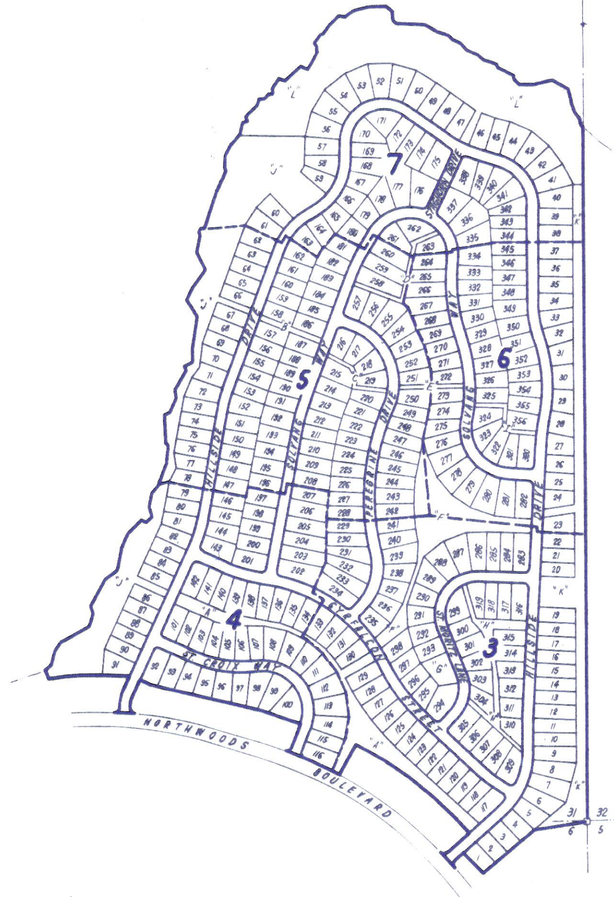
INDEX MAP SCALE 1"=500'