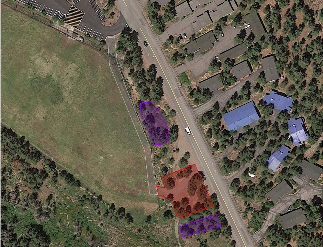
ADA Walkway Archaeological Site, Stormwater Basin Trout Creek Trailhead