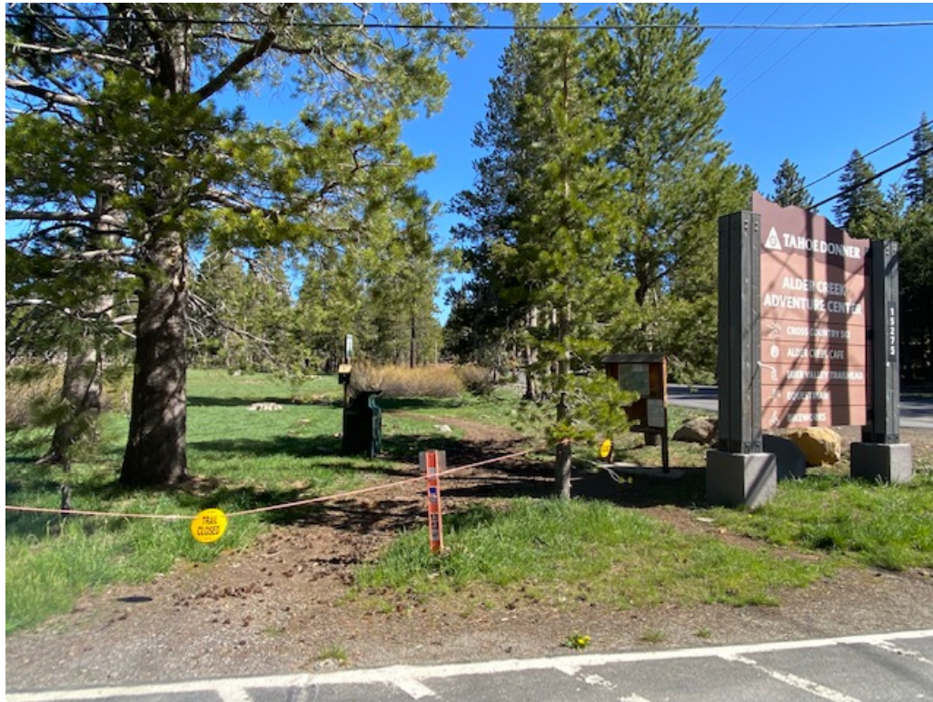
Alder Creek Trail, Closed at ACAC on May 19