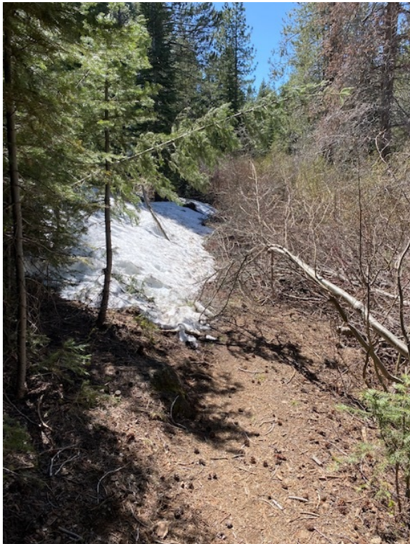
North-Facing Trails, Mid Elevation on May 19