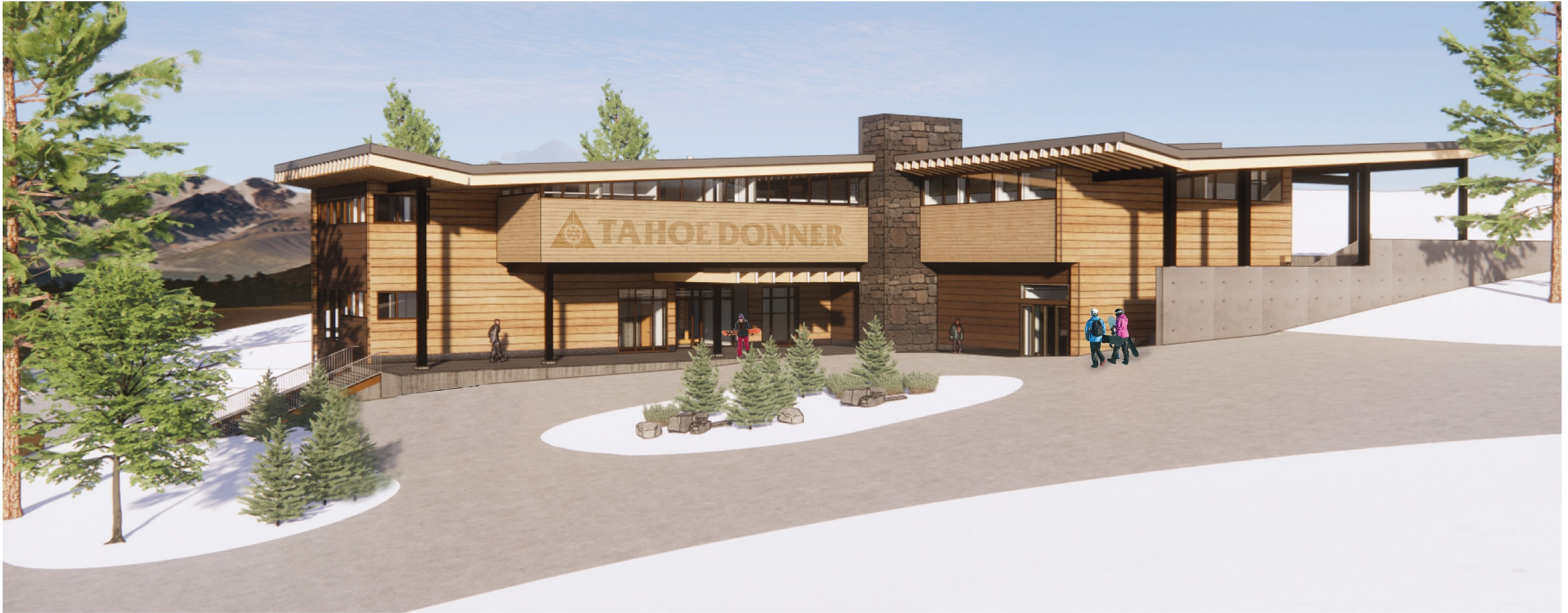
EXTERIOR VIEW/ELEVATION - STREET (WEST) SIDE

TAHOE DONNER DOWNHILL SKI RESORT JUNE 10, 2022