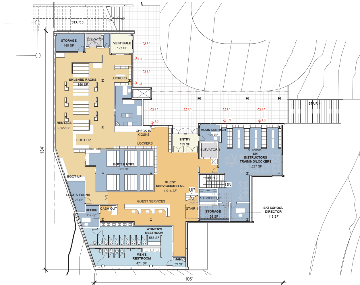
FLOOR PLAN - LEVEL 2

TAHOE DONNER DOWNHILL SKI RESORT JUNE 10, 2022