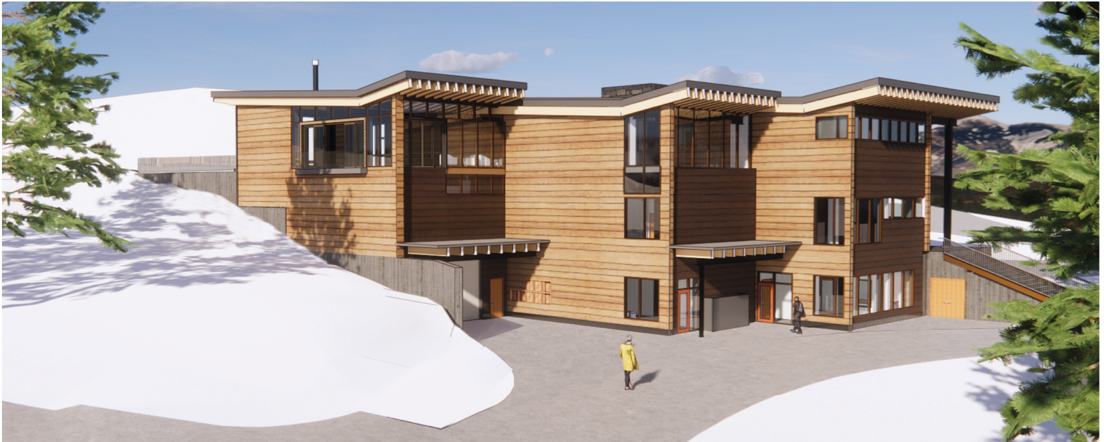
EXTERIOR VIEW/ELEVATION - NORTH-EAST SIDE