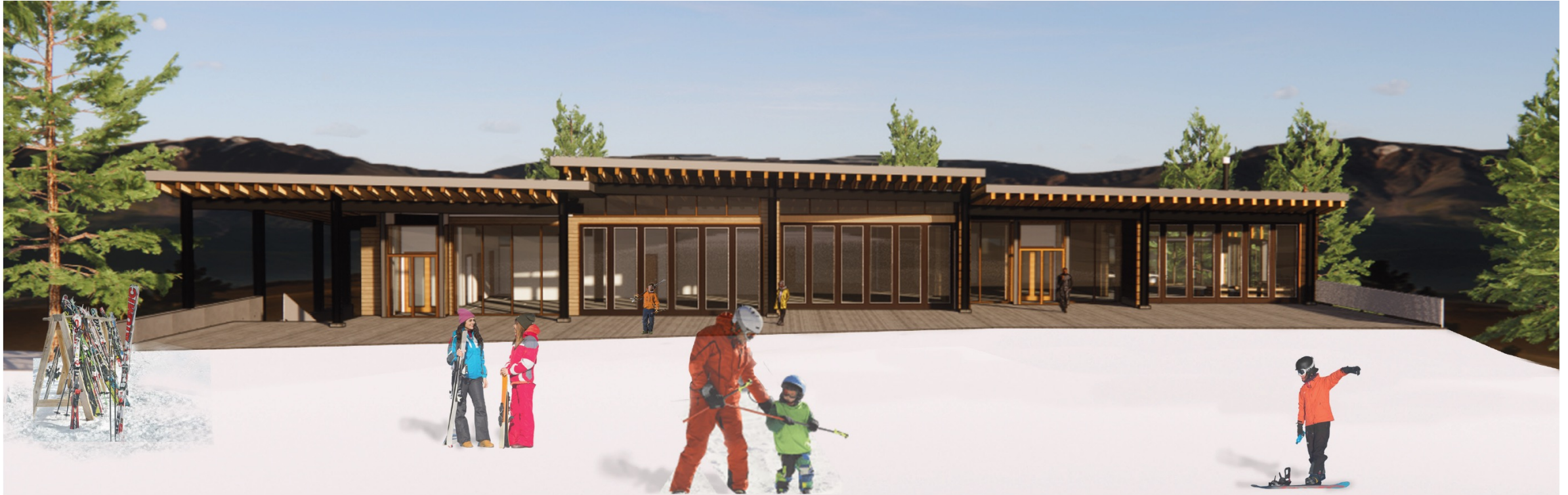
EXTERIOR VIEW/ELEVATION - SKI LIFT (SOUTH) SIDE