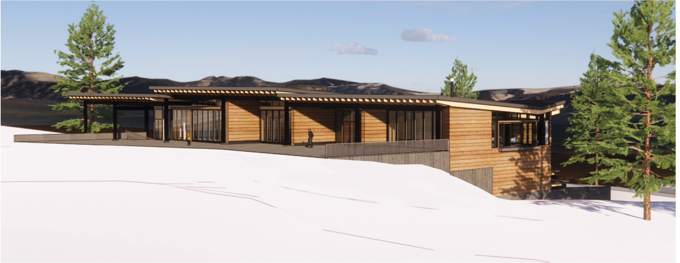
EXTERIOR VIEW/ELEVATION - SOUTH-EAST SIDE

TAHOE DONNER DOWNHILL SKI RESORT JUNE 10, 2022