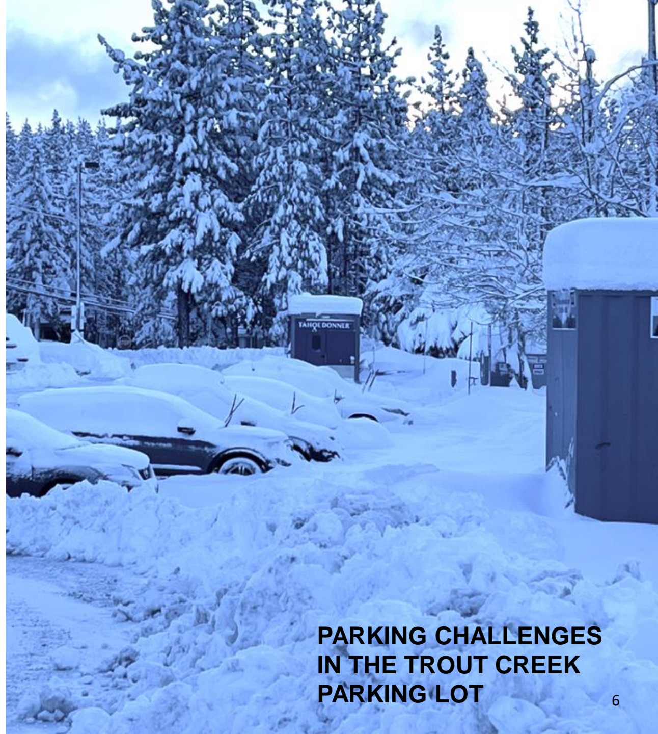
PARKING CHALLENGES IN THE TROUT CREEK PARKING LOT