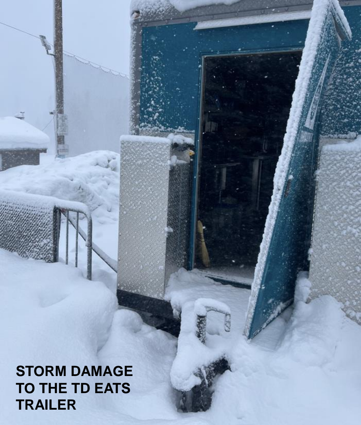
STORM DAMAGE TO THE TD EATS TRAILER