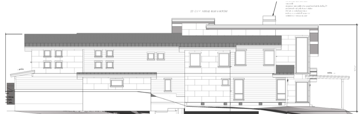
SOUTH ELEVATION SCALE 1/4" = 1'-0"

Provide exterior finish over area of 110 sq. ft. minimum for each 50 sq. ft. of floor area. When a Glass Topper is used, it must be installed within the same amount of vertical material as the 50 sq. ft. of floor area. The vertical finish shall be installed 1.5' out of face of the wall. (SEE SECTION 2) Show exterior finish and complete with DEC. 2022. 5% SLOPE FROM FOUNDATION FOR SET AWAY