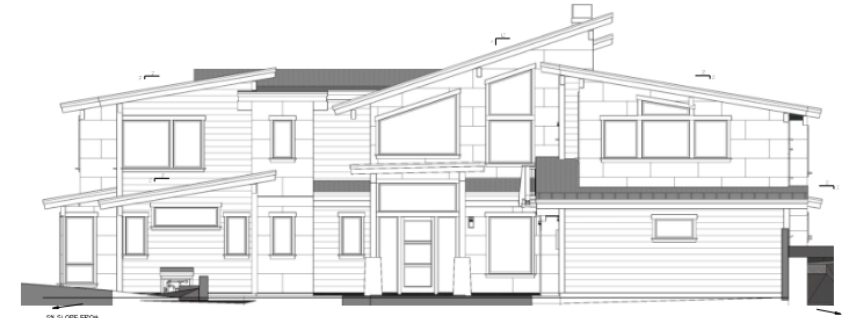
WEST ELEVATION SCALE 1/4" = 1'-0" STREET SIDE