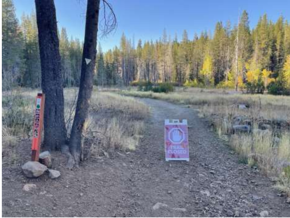
Above Photo: Existing trail surface conditions