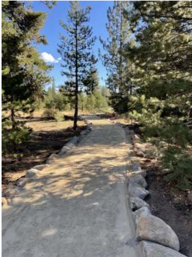
Above Photo: Proposed trail surface improvements