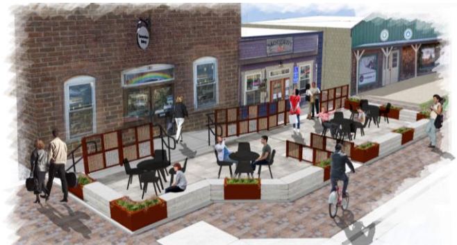
DONNER PASS ROAD LOOKING SOUTH