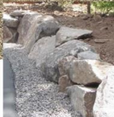
ROCKERY RETAINING WALL: GRAYS [NO PEACH/ORANGE SUBTERRANEAN BOULDERS]