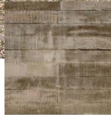
BOARD FORMED CONCRETE: ROUGH SAWN 8X w/ 1/8" GAP STAIN: LIVING EARTH TAWNY + ARCTIC GRAY