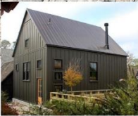
VERTICAL SIDING: HARDIE PANEL SELECT CEDARMILL PRIMED TO PT w/ HARDIE BATTENS BENJAMIN MOORE VINTAGE VOGUE